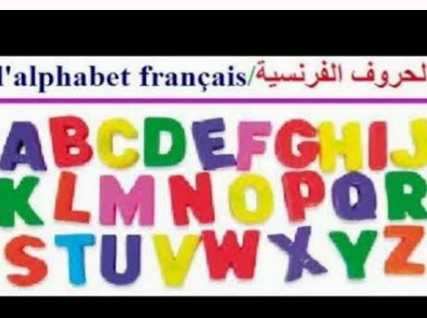
Alphabet images free download. Abc images free download. Alphabet letters images free download.